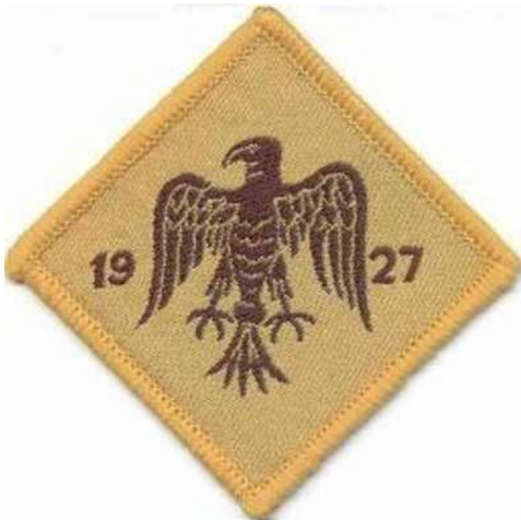
The Eagle – our Group badge, find it on the back of our scarves