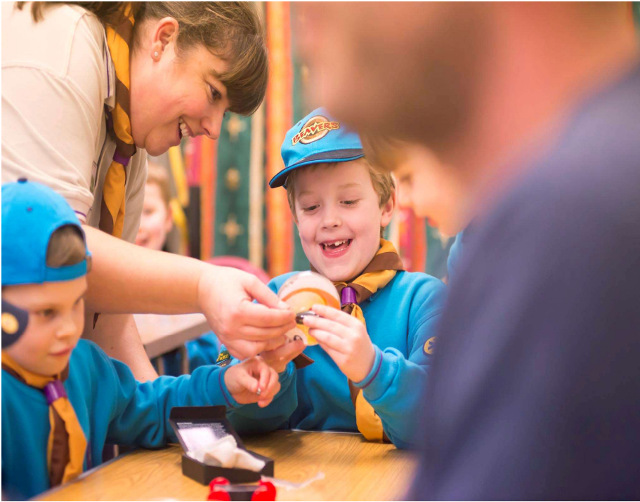
Beaver Leader in Action